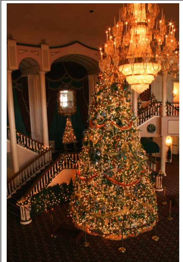
“The Grand Palace Theater”