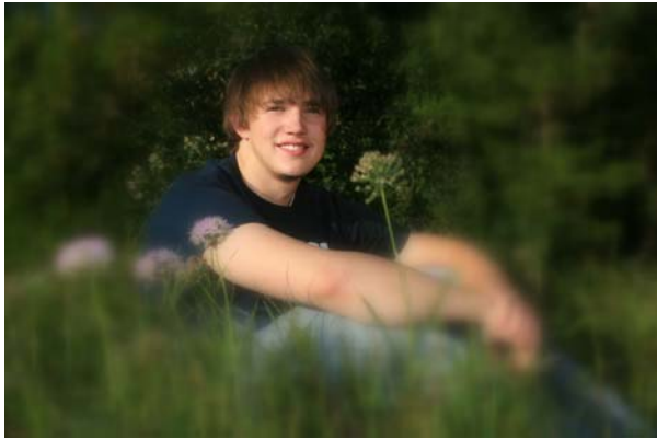
Senior portraits “on the cheap!”

September went so fast this year, it’s almost like it didn’t even exist! I just looked at the calendar and realized that it was time for another edition of the “Sioux Projector”, and unlike most other months, I don’t have a running list of newsy items to share. In fact, I don’t have much of anything. Now that’s a scary thing when it happens, mostly because when I don’t get a bunch of tidbits from members, I am forced to fill space in my own creative way. Trust me; it’s a lot easier when you folks provide me with some good “stuff”. I can’t believe that no one has a helpful tip or creative gadget to offer. I don’t believe for a moment that some of you don’t have an interesting photo experience to