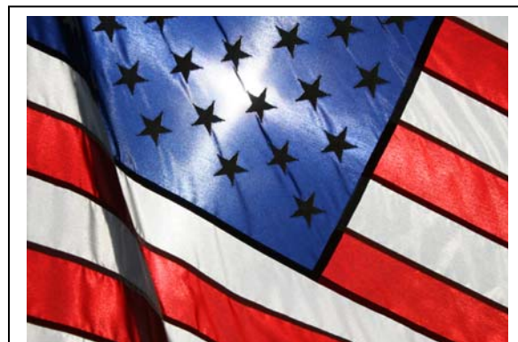
Check out the cross!