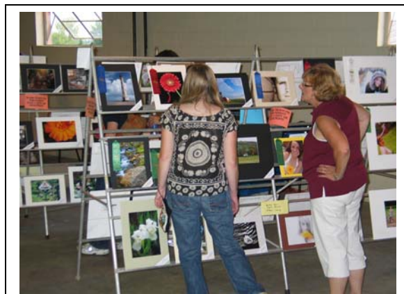
Visitors at fair view award-winning photographs at SFCC exhibit

1 st Place – Slide Landscape - “Mesa Arch” 3 rd Place – B&W Landscape – “Gull Standing Guard” HM – Slide Landscape – “The Mitten” HM – Slide Landscape – “Pelican” HM – Slide Landscape – “Gristmill” Merit – B&W Landscape – “Sharecropper’s House”