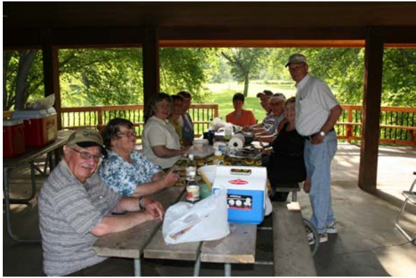
SFCC members at Big Sioux picnic

So, maybe you can tell me where summer went... Seems like only yesterday I was scampering about trying to get things ready for summer, and now it's just about over! Actually, unlike many of you, I am one who hopes to see the first snowfall come about July 8 th , but seldom get my wish. The end of the park season (and actually, we still have a little more than a month left to our busy season here in the southeast tropics...) usually means things slow down for us a bit, but it also means the summer help is gone.