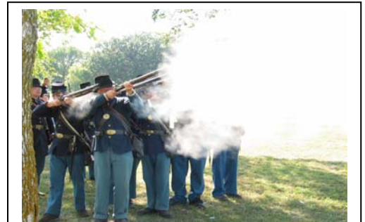
A volley from the 13 th Infantry!

Remember- Happy "Clickers" Take Better Pictures!