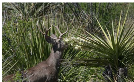
Mule deer feeding on yucca flowers