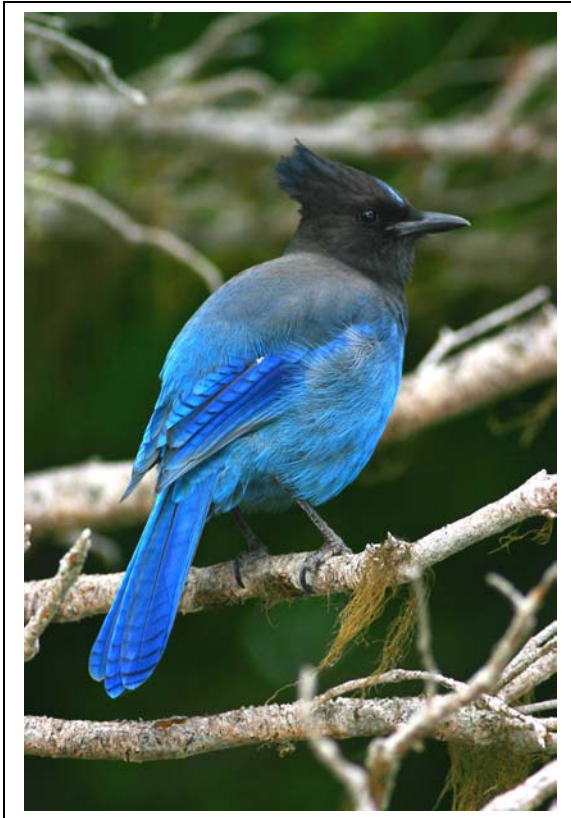
Stellar's Jay, Mount Rainier NP