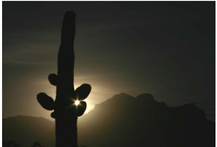
Moonrise and Saguaro, Superstition Mtns

Interested? Contact Marty DeWitt for info and to sign up for the meal.