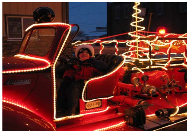
In the Spirit of Christmas!