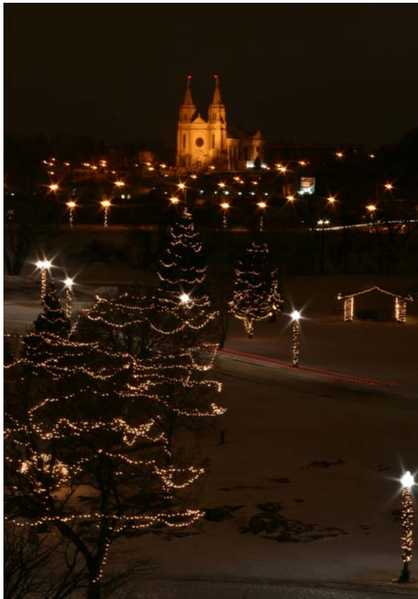
Falls Park Holiday Vista