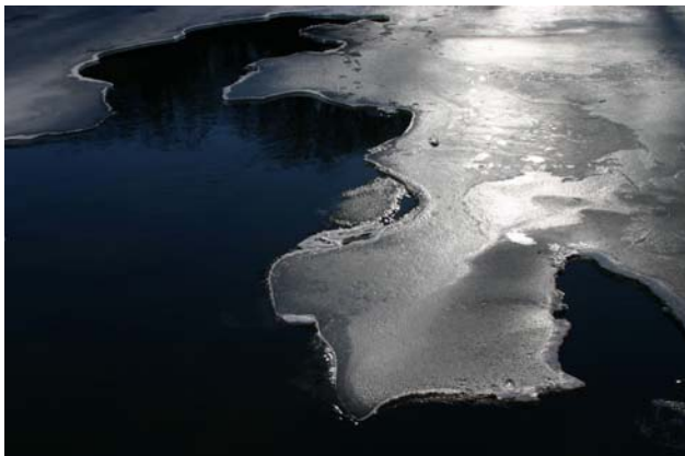
Ice on Split Rock Creek

The SFCC will meet at the Kenny Anderson Community Center, located at Ann Sullivan Elementary School, 3701 E 3rd Street, Sioux Falls, South Dakota. NOTE-WE MAY BE IN A DIFFERENT ROOM. WATCH FOR SIGNS!