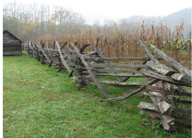
Don't Fence Me In