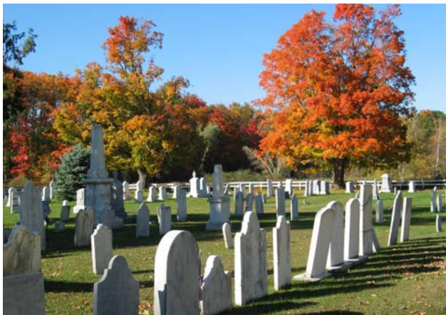
The Rise and Fall