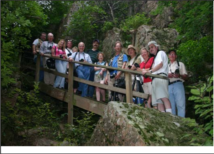
Palisades State Park, Saturday, July 30, 2005

SFCC members and guests ventured out to Palisades for an afternoon of shooting and eating. A great time was had by all, and I trust there were some award-winning images captured for future contests.