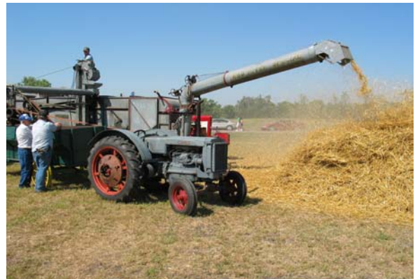
Threshing at its Best!