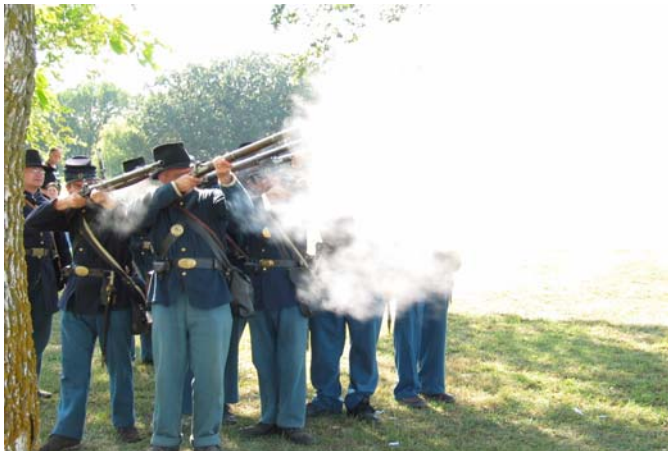
Ready, Aim, Fire!